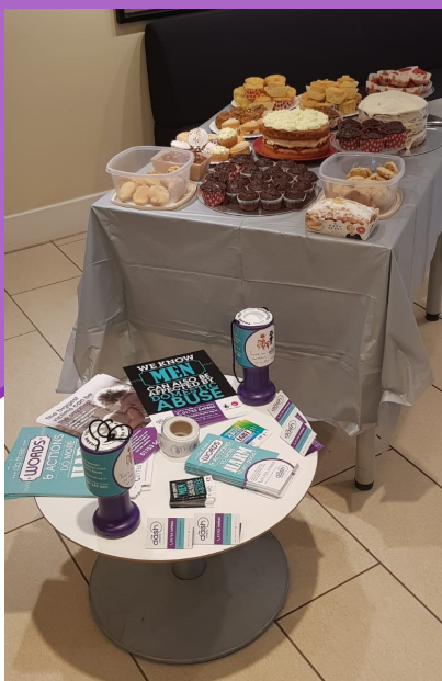
A Dash Bake Sale

We have run dozens of successful cake sales, own clothes days, and community events in partnership with schools and youth organisation. We have provided practical support, resources and staff to help run events for partner organisations from the minute we start organising events, and Dash are looking to expand our community reach and partnerships!